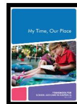
My Time, Our Place; Framework for School Age Care in Australia 2022 V2